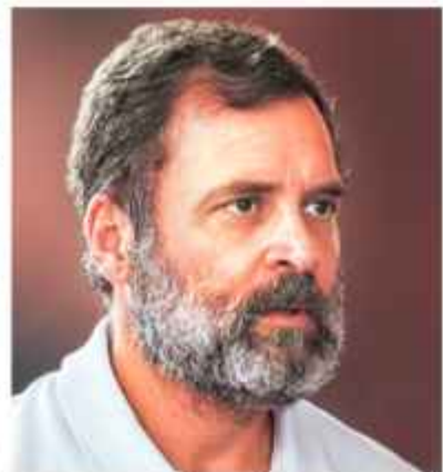
Leader of Opposition Rahul Gandhi said youth had been trapped in Agniveer chakravayuh as no provisions had been made in Budget for their pension